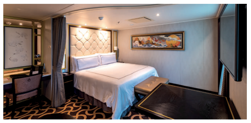
Palace Deluxe Suite From 41 sq.m | Max Occupancy 4 | Deck 15 1 Queen-size Bed + 1 Double Sofa Bed

Palace Deluxe Premium From 41 - 61sq.m | Max Occupancy 4 | Deck 9 / 10 / 11 / 12 / 13 / 15 1 King-size Bed + 1 Double Sofa Bed