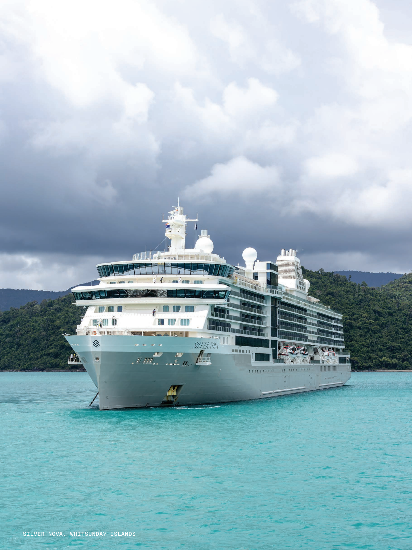
SILVER NOVA, WHITSUNDAY ISLANDS