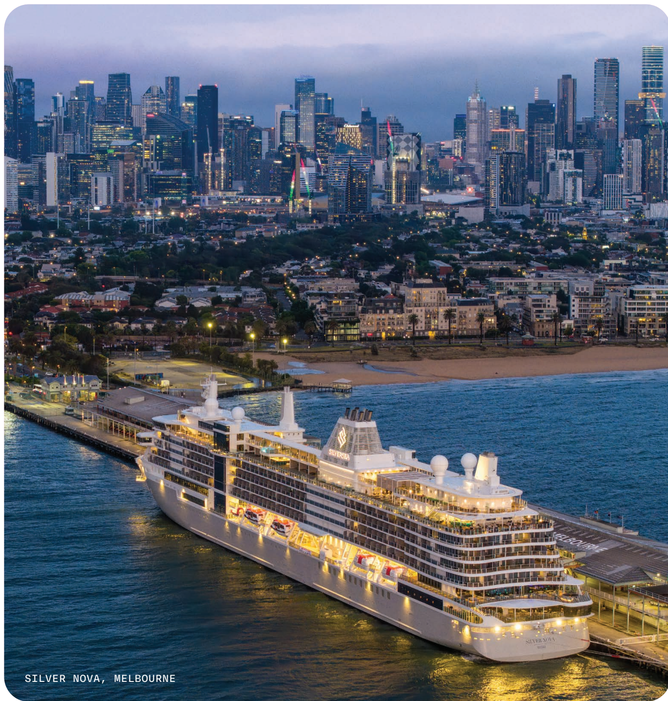
SILVER NOVA, MELBOURNE