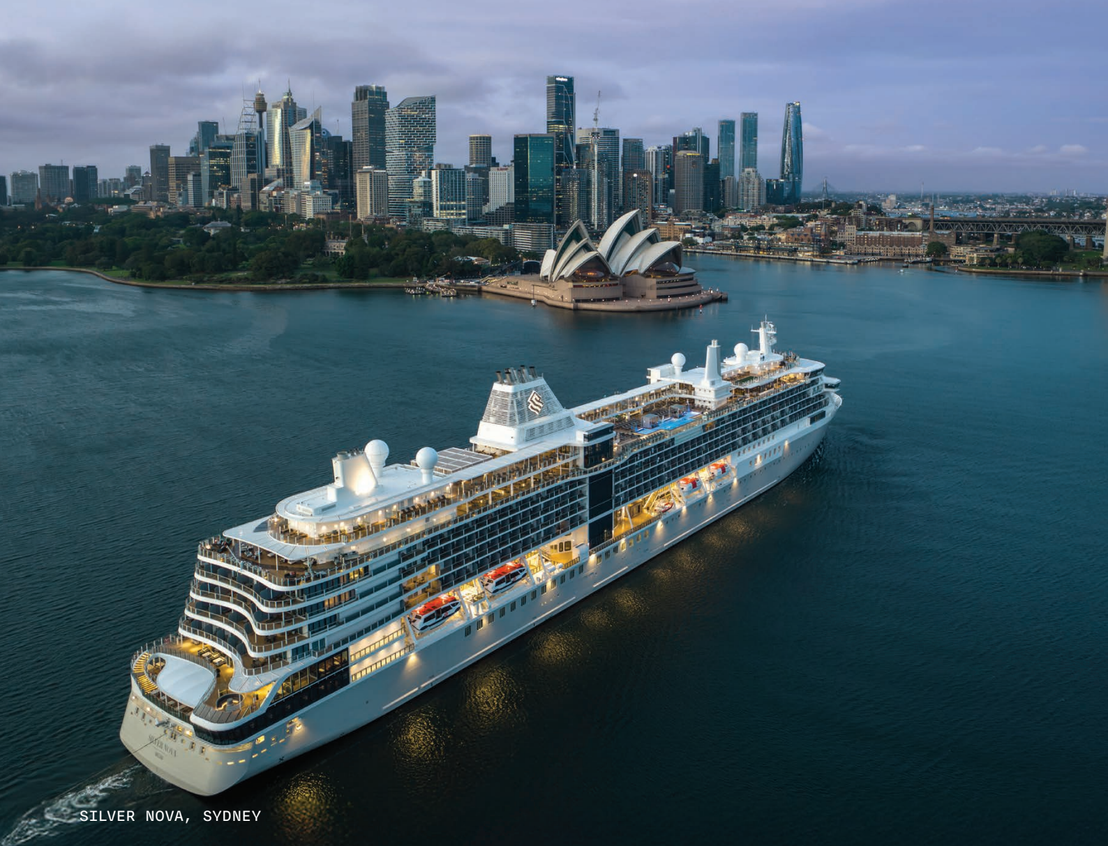
SILVER NOVA, SYDNEY